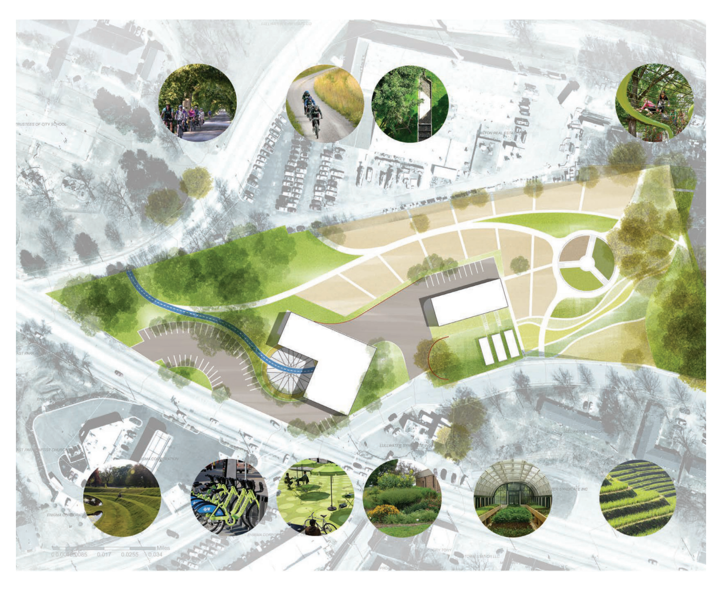
Figure 4: Site plan for project focusing on synergy between bike transportation and food access.

families. This led the students to understand that most challenges are not singular and isolated but rather multiple, interdependent and interconnected. One challenge leading to the inability to purchase fresh food was a lack of basic and affordable transportation. Low cost, reliable, and easily accessible transportation such as bicycling would allow residents to reach places to purchase food, allow residents to access more job opportunities, and encourage a healthy lifestyle.